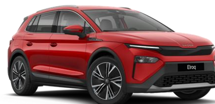
Velvet Red (K1K1 - Exclusive)