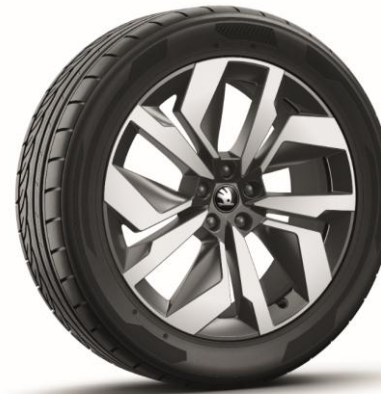
20" 'Vega' alloy wheels (Code CB2/65Q)