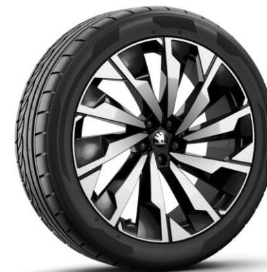
21" 'Supernova' alloy wheels (Code PJP)