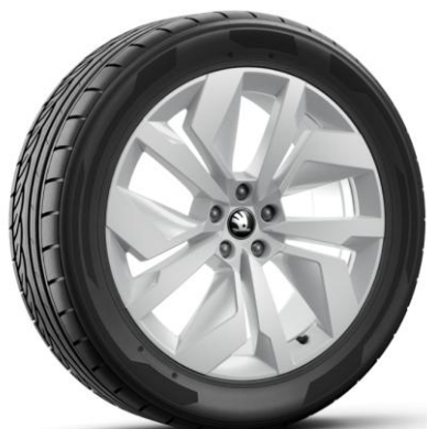
20" 'Vega' alloy wheels (Code PJD)