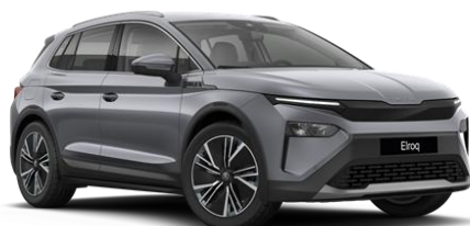
Graphite Grey (5X5X - Metallic)