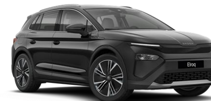
Black Magic (1Z1Z - Metallic)