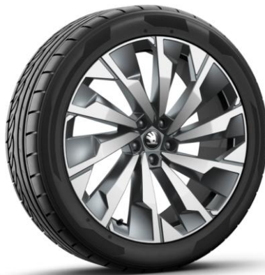
21" 'Supernova' anthracite alloy wheels (Code PJN)