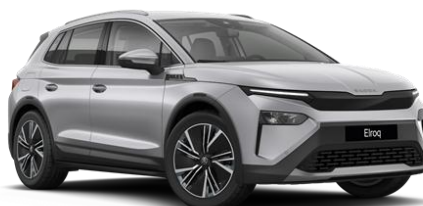
Brilliant Silver (8E8E - Metallic)