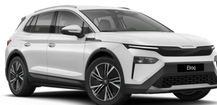
Moon White (2Y2Y - Metallic)