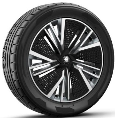
20" 'Neptune' alloy wheels (Code 40T/56H)