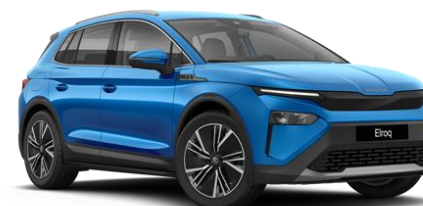
Race Blue (8X8X - Metallic)